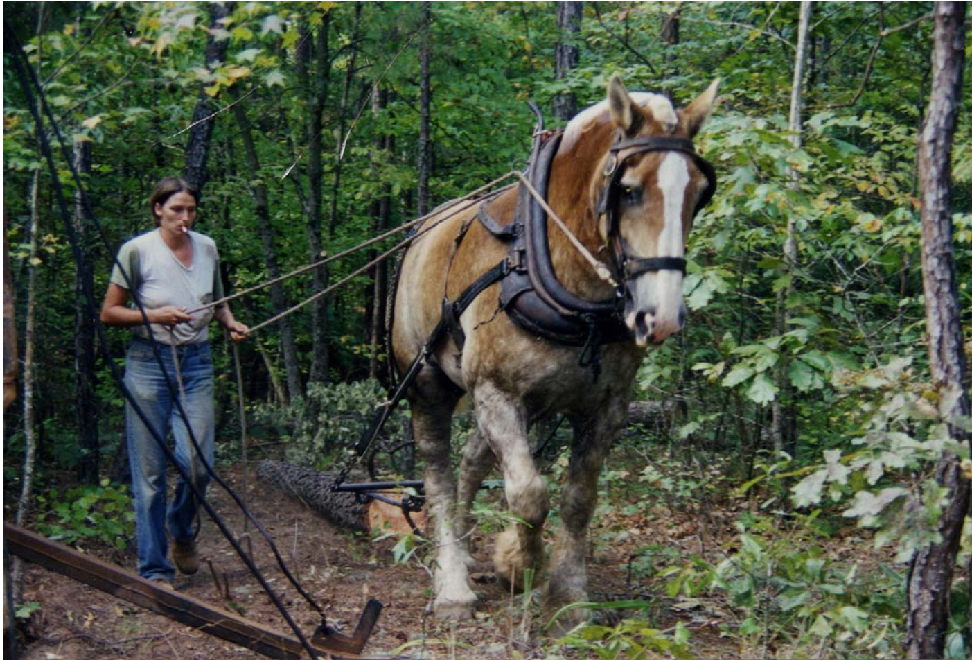
Woman in forest work in Alabama, USA 1998.