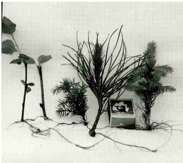
Fig. 1. Examples of cuttings rooted in early 1960's. From left: birch, alder, juniper, Scots pine and Norway spruce.

In Finland, experiments with rooting of cuttings were started by the Foundation for Forest Tree Breeding (FFTB) in 1962, with facilities donated by the Finnish Plywood Industry. Many species were included from the beginning, e.g. birches, Norway spruce, Scots pine, larches, hybrid aspen, alders, maple and elms (Fig. 1). The first results were very promising, leading to the conclusion that "it seems possible that cutting propagation will soon become a shortcut to the application of tree breeding results in practical reforestation" (FFTB 1962).